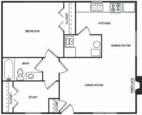
A 1 Bedroom / 1 Bath / Study - 884Sq. Ft.*