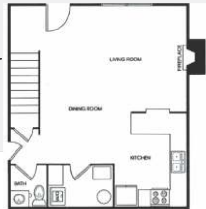
2 Bedroom / 1.5 Bath 1,058 Sq. Ft.*