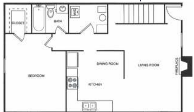
1 Bedroom / 1 Bath 880 Sq. Ft.*